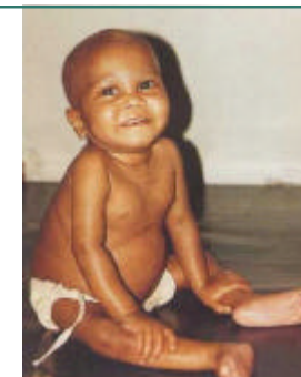
Left: Five weeks later